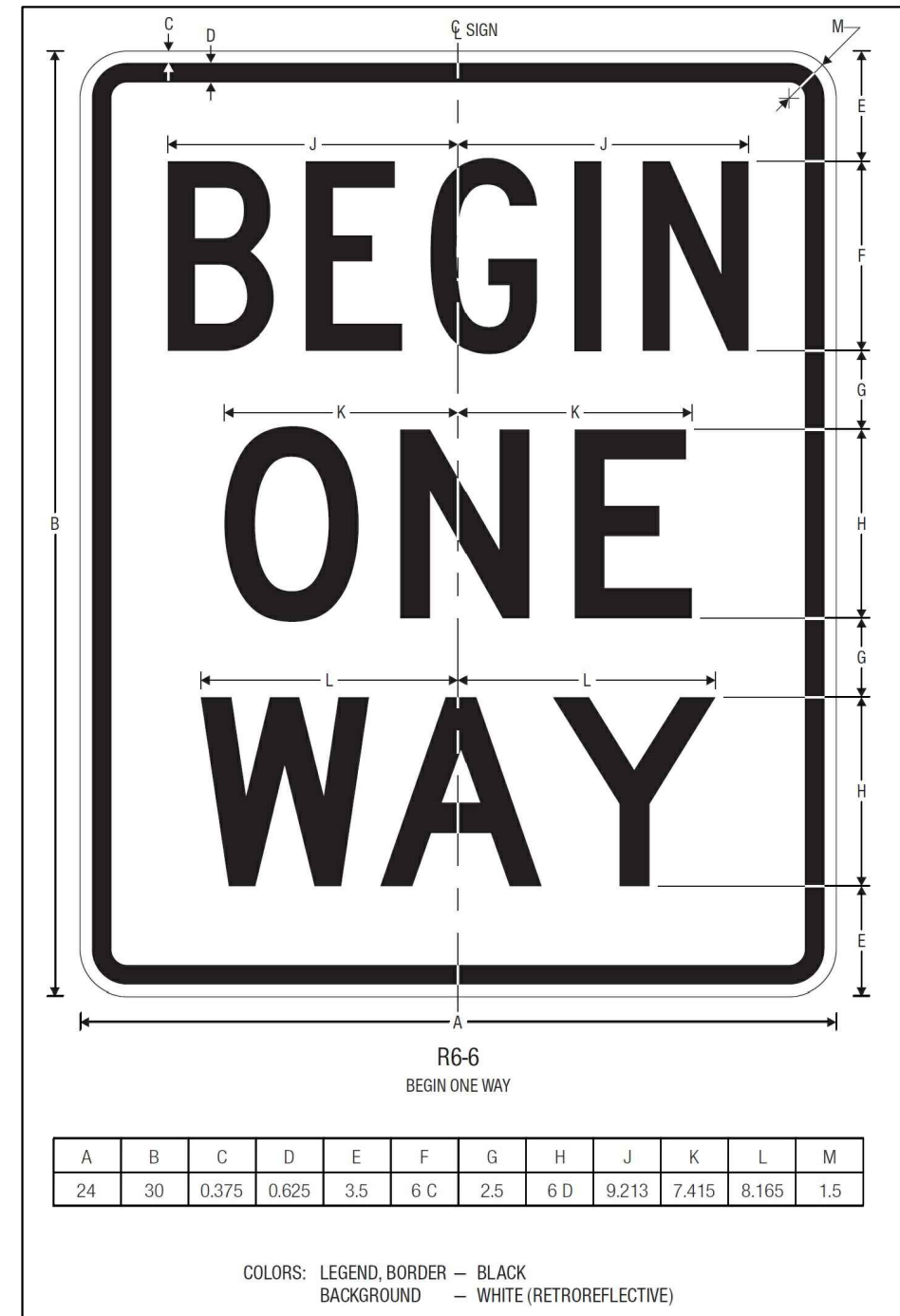
R6-6 'BEGIN ONE WAY' SIGN